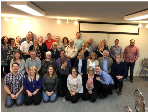
A group of the Atlantic District Clergy.

Many Atlantic Churches are starting new and exciting fall programs and we appreciate your prayers as we endeavor to reach the lost in our District!