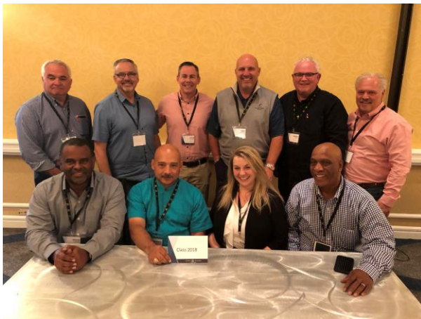
The 10 new District Superintendents for the USA/Canada Region.

September 4-7, 2018, marked the 25th anniversary of the District Superintendents Leadership Development Program in Colorado Springs, Colorado. The D.S.L.D.P. is an annual conference that provides support and training to USA/Canada district superintendents. It is designed by district superintendents for district superintendents to network with each other and train for their position. Our District Superintendent Advisory Committee (D.S.A.C.) also had a chance to meet and fellowship during these days.