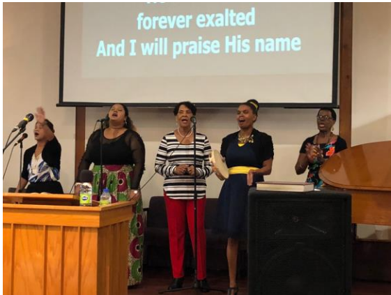
Montreal First Worship Team