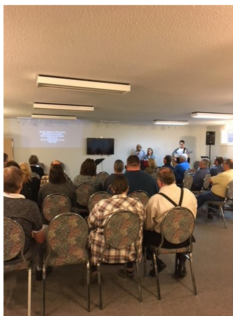
Clergy and Spouses during the worship services.