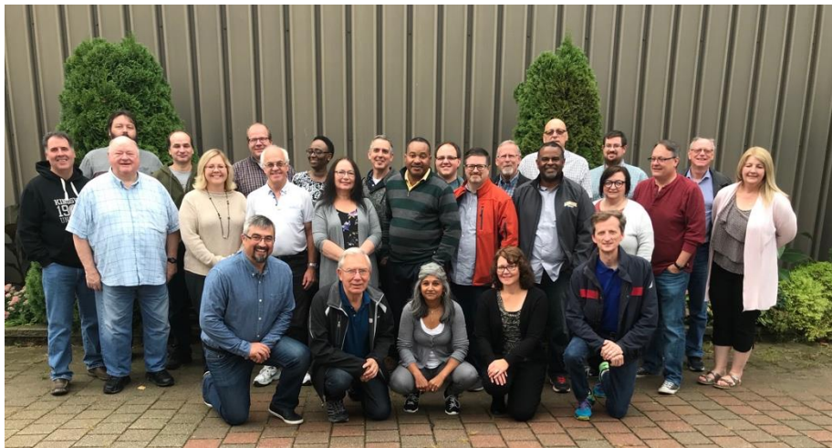
Nazarene, Wesleyan, and Free Methodist Leaders at Coaches Training at Wesley Acres