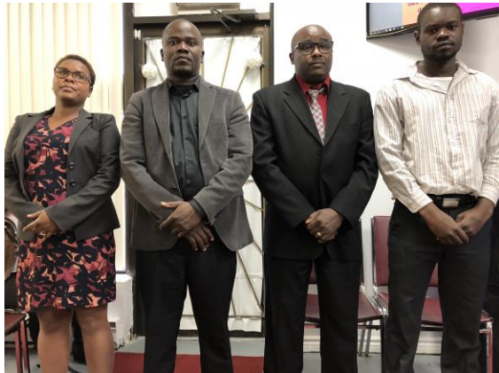
The Leadership Team of the new Anjou Church