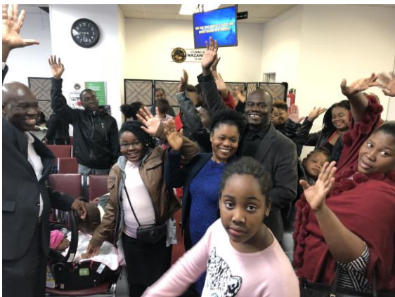
← Some of the new congregants at the Anjou Church of the Nazarene